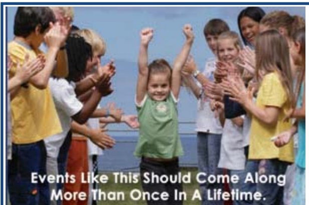
Events Like This Should Come Along More Than Once In A Lifetime.

Oct. 21 -- Luncheon: Salute to House-keeping; Courtyard by Marriott Collierville.