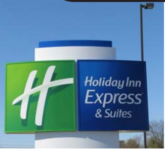
It's new, it's beautiful, it's the Holiday Inn Express & Suites & it's in . . . Millington! Love the new logo! (Is it ready to tee off or am I seeing things?)