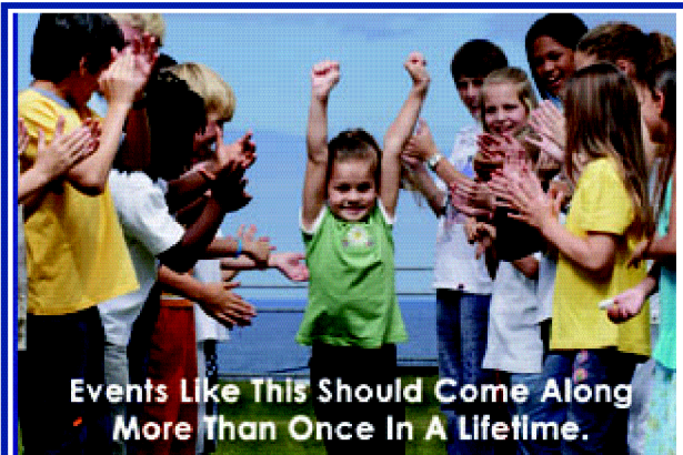
Events Like This Should Come Along More Than Once In A Lifetime.

Nov. 16 -- Sales: How To? Memphis Marriott Downtown.