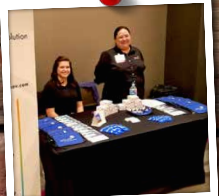
Reps from the sponsor Nolan with plenty of free promo goodies to take home