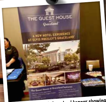
The Guest House at Graceland banner showing off the facilities