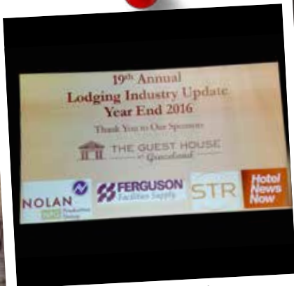
A big thank you to our sponsors!